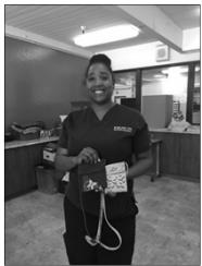
ESKATON CARE CENTER GREENHAVEN