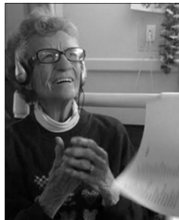
VIENNA NURSING AND REHABILITATION CENTER