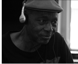
ESKATON CARE CENTER GREENHAVEN