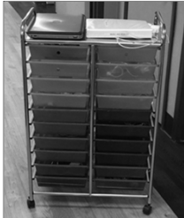
SAN JOSE HEALTHCARE & WELLNESS CENTER