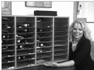
NORTH POINT HEALTHCARE & WELLNESS CENTER